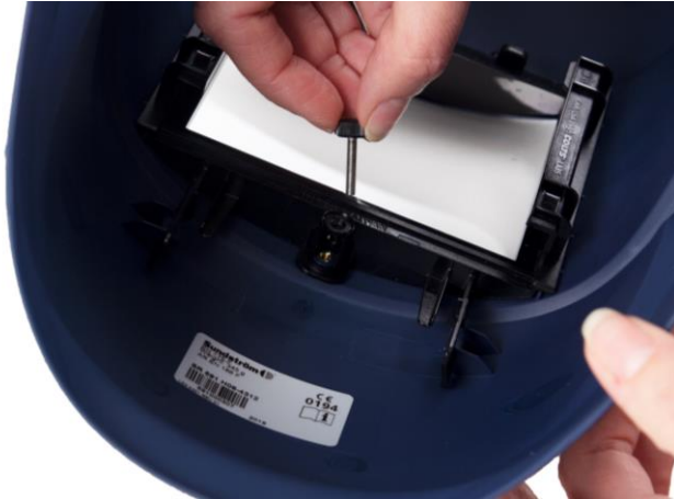
6.1 Loosen the screw in the holder for the welding filter.