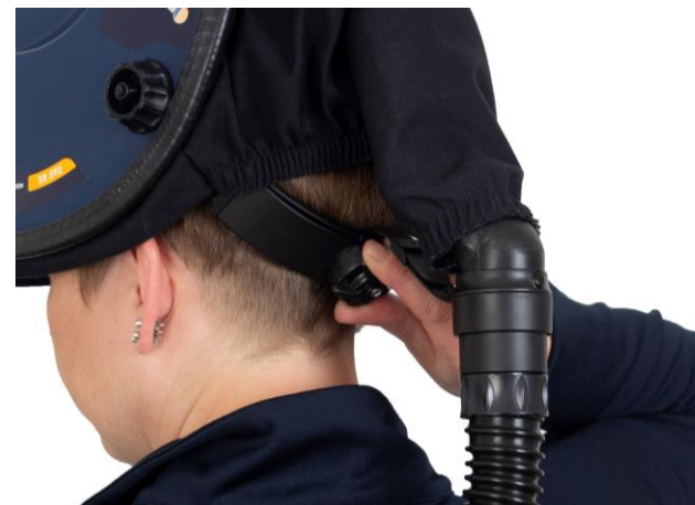
1.4 Width adjustment of the head harness. Adjustment of the width of the head harness.