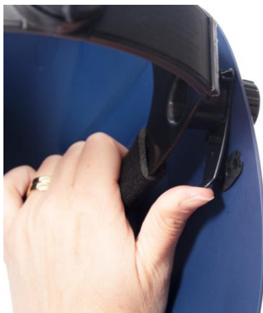
1.2 How high the welding shield sits on the head. The angle against the shield.