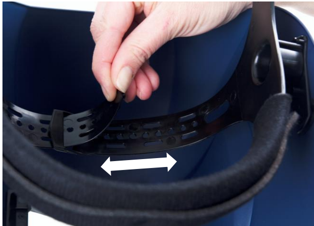
1.1 Height adjustment. How high the welding shield sits on the head.