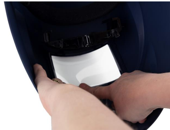
6.4 Fit the protective lens. Fit the holder. Tighten the screw.