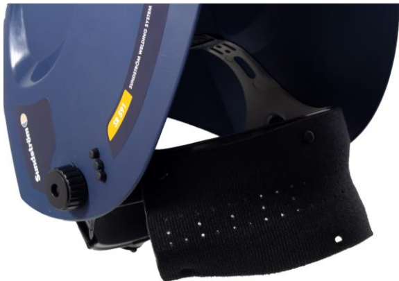
7.2 Fit the sweatband on the head harness.