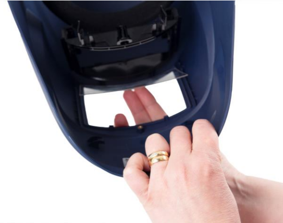
6.3 Release and remove the outer protective lens