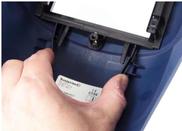
6.2 Release the holder for the welding filter.