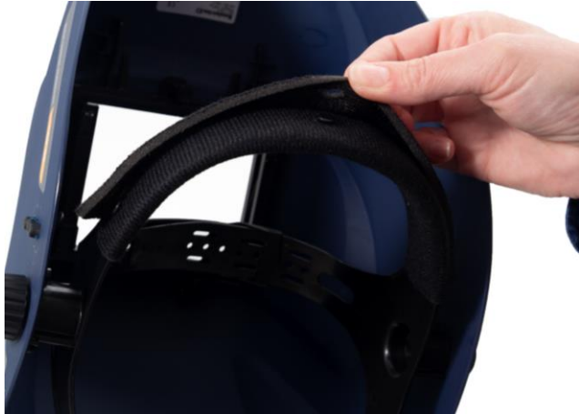
7.1 Remove the sweatband