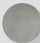
SR 336 STEEL NET DISC ITEM NO. T01-2001