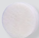
SR 221 PRE FILTER ITEM NO. H02-0312