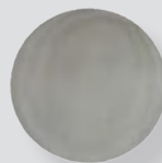
SR 336 STEEL NET DISC ITEM NO. T01-2001